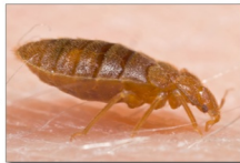
Adult bed bug feeding on a human